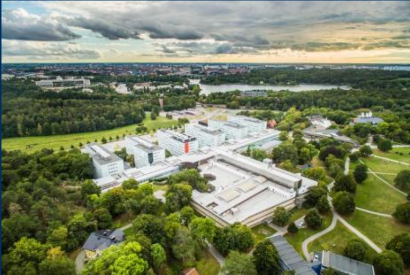
Kista Science city