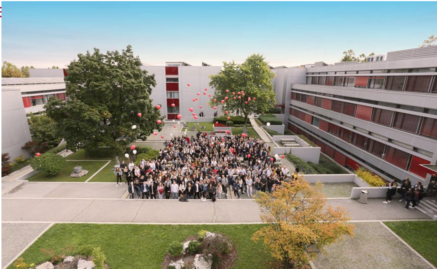
University of Ljubljana SCHOOL OF ECONOMICS AND BUSINESS

More than 1000 international students represented across campus - great international study environment with cross-cultural learning